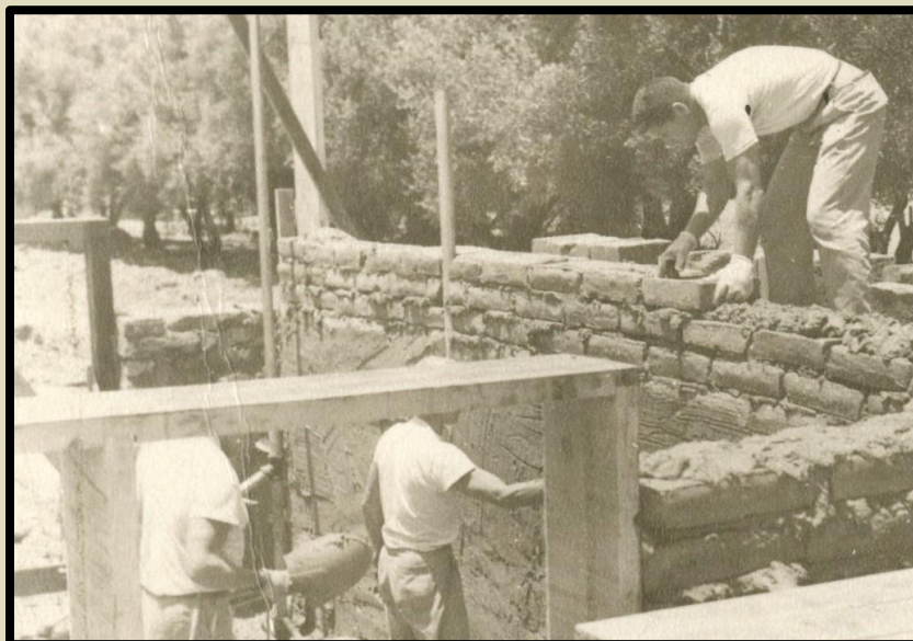
Restoration at Pala Mission with Native American parishioners assisting, 1955